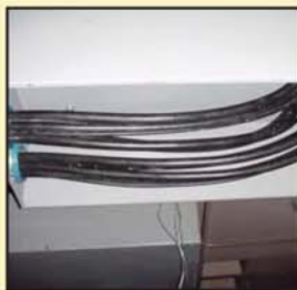
Conduit Pull Box